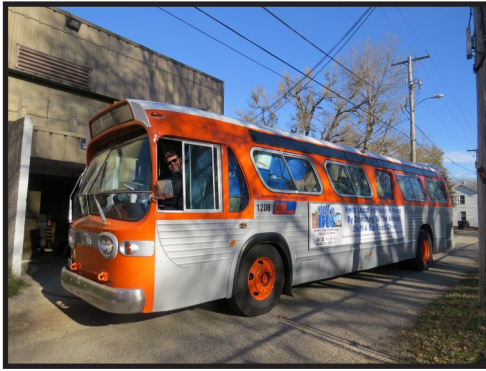
ATU #416 President Corey Sebens at Friendship House with the bus full of donations.

The 34th Annual Stuff-A-Bus food drive to benefit the Peoria Friendship House of Christian Service officially wrapped up was Oct. 22-Nov. 30, 2021. The total weight of the food collected on the vintage bus during the campaign was 18,840 pounds or 9.42 tons. An additional 1,480 pounds of excess donations that were unable to fit on the bus were loaded onto a CityLink van. The total weight of donations collected totaled 20,320 pounds or 10.16 tons, which exceeded the 10 ton goal!